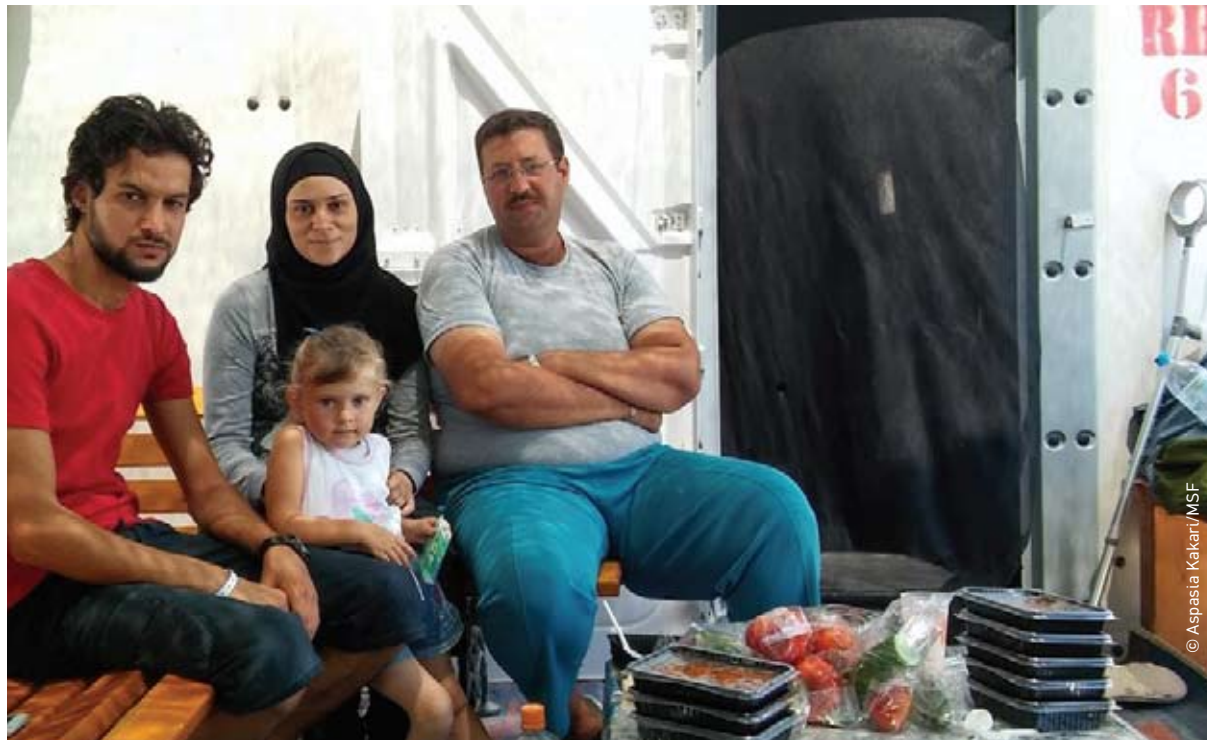
Kara Tepe, Lesvos / July 2016

*sms are expected to be sent to all the people who pre-registered for asylum. The sms will inform them on the date of their appointment to be fully registered.