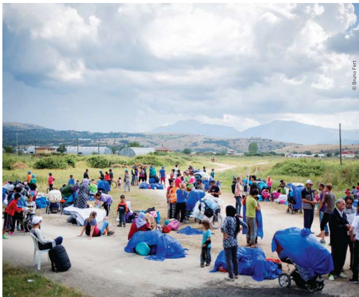
Katsikas / July 2016

While the hotspots are overcrowded, the reception conditions on the mainland where the people who arrived before the 20 March were moved are no better. The strategy of encampment should be a short-term solution, but due to the acute slowness of the system, we are currently looking at a timeframe where people will be in camps for years. Though the situation differs a lot from one camp to another, most of the asylum seekers are living in appalling conditions, which can be dangerous for their health. This is particularly true for the warehouses where people from Idomeni area were moved in May, where there are, on top of the poor living conditions, major safety concerns. Even if some improvements have been observed in the last months, the services in the camps remain sub-standard. In particular: