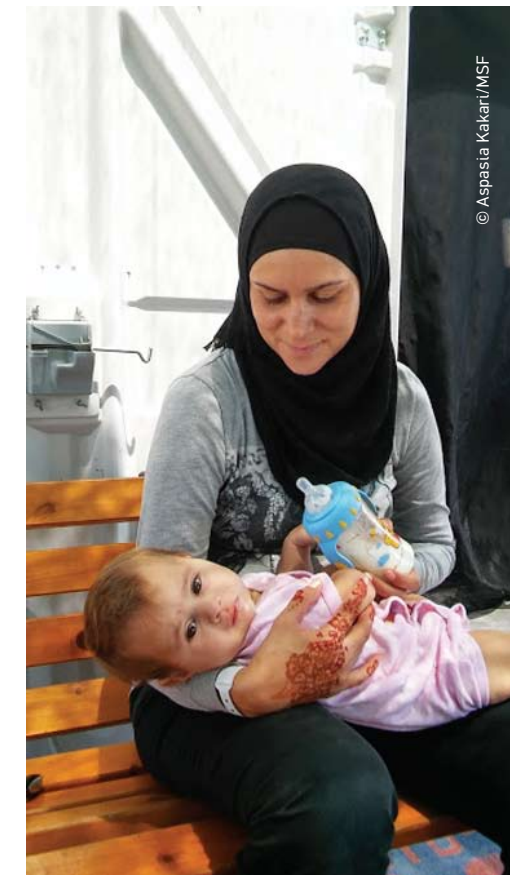
Kara Tepe, Lesvos / July 2016

In order to have access to primary health care structures (PEDY) and to have access to the scheme where healthcare costs – including costs of drugs- are subsidized, people who are pre-registered have to obtain a tax registration number and social security registration number. Though MSF welcomes the fact that the access to primary health care facilities has recently been extended to asylum seekers under the new law, we find that the administrative barriers remain in place, as people are not informed on how they should proceed and where they should go to obtain the required documents. The staff in the hospitals and health care centres are also not always aware of the new law.