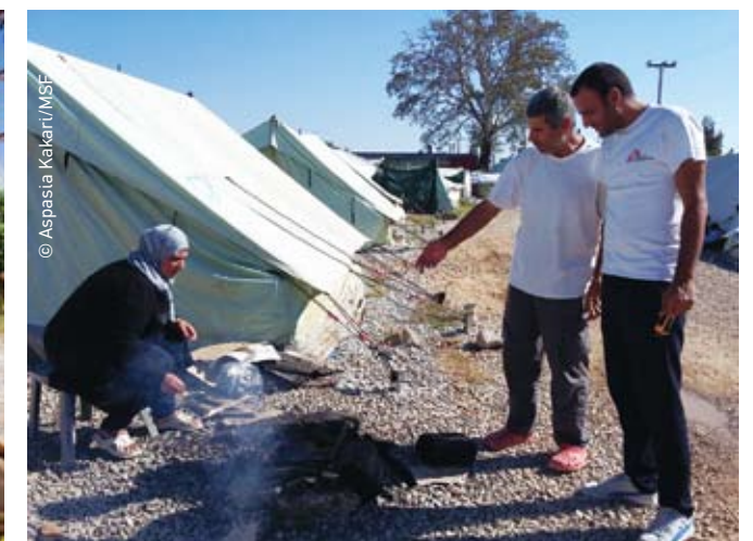
Softex, Thessaloniki / September 2016