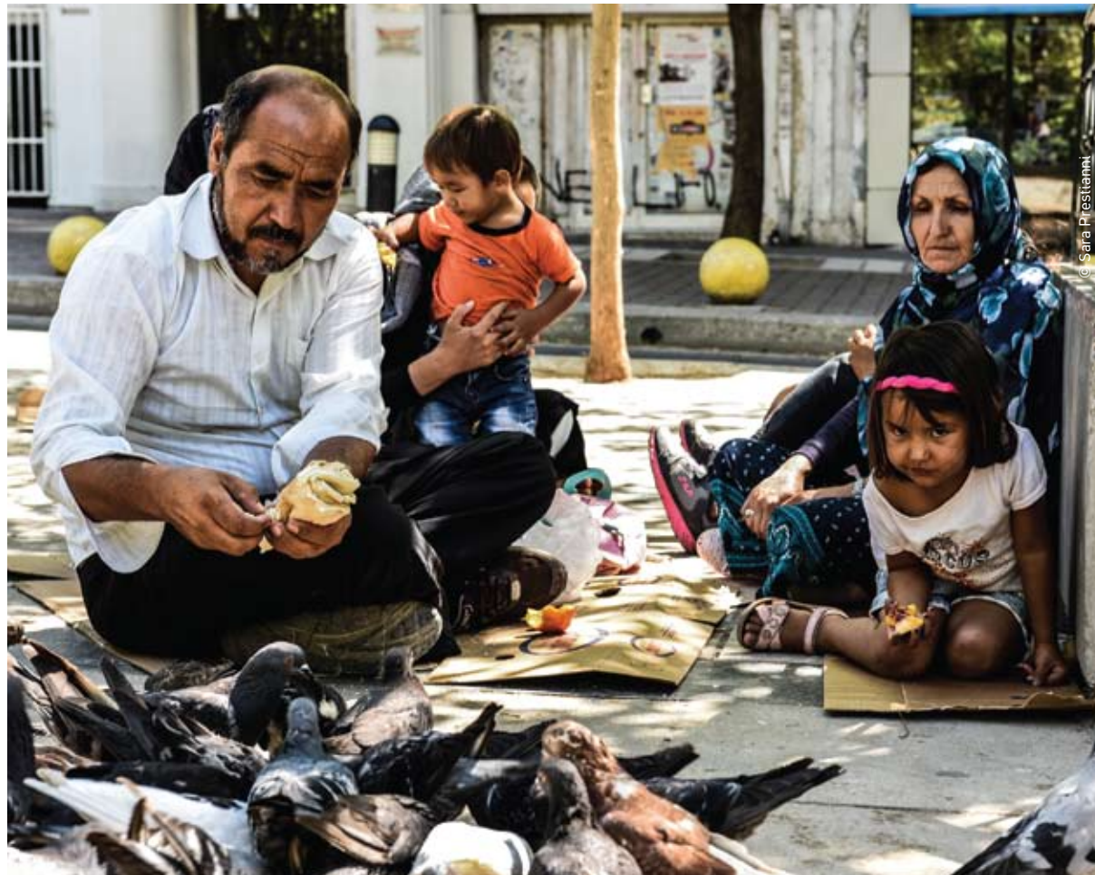
Victoria Square / August 2016

Despite hundreds of millions given to the Greek government and to international NGOs 1 , the humanitarian response remains inadequate and very slow. The lack of leadership and willingness of the Greek authorities to cooperate with other actors has a serious impact on the coordination and planning of the response. The failure to publish the final list of the camps which will remain open is one of the most blatant examples and is