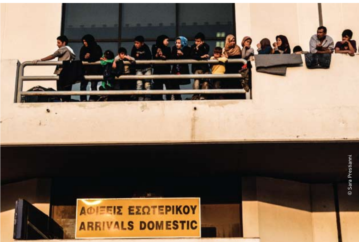
Elliniko / August 2016

Seven months after the closure of the border with FYROM, more than 50,000 people are currently stranded in Greece of which over 15,000 on the islands. As though that weren't enough, the implementation of the EU-Turkey statement at the end of March 2016 has strengthened the policy of deterrence run by the EU by putting in place an organized way to deny access to a safe environment to those having fled war-torn countries and in search of protection.