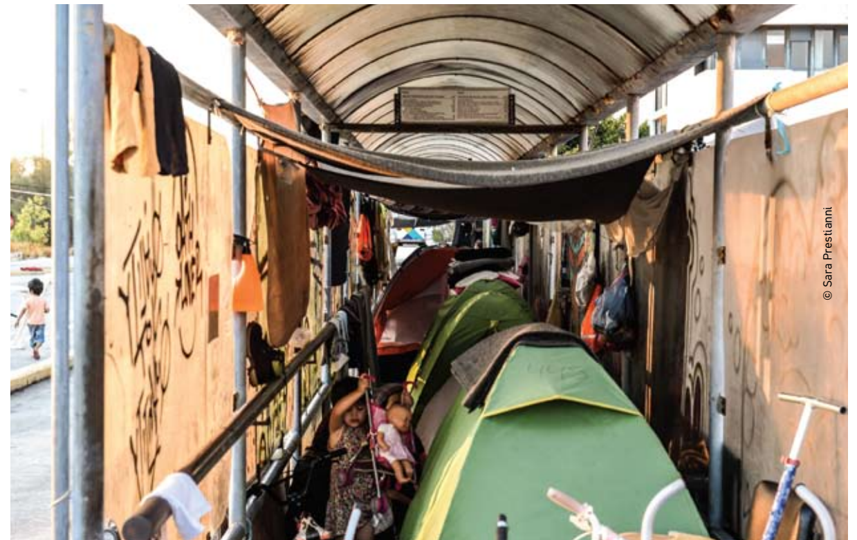
Elliniko / August 2016

Relocation should also be strengthened and speeded-up: whereas in September 2015, the European Union pledged to relocate 66,400 people from Greece, this has not been translated into practice. As of the 14th October, of the meagre 16,532 places pledged by EU Member states for relocation, only 4,716 persons have been relocated from Greece.