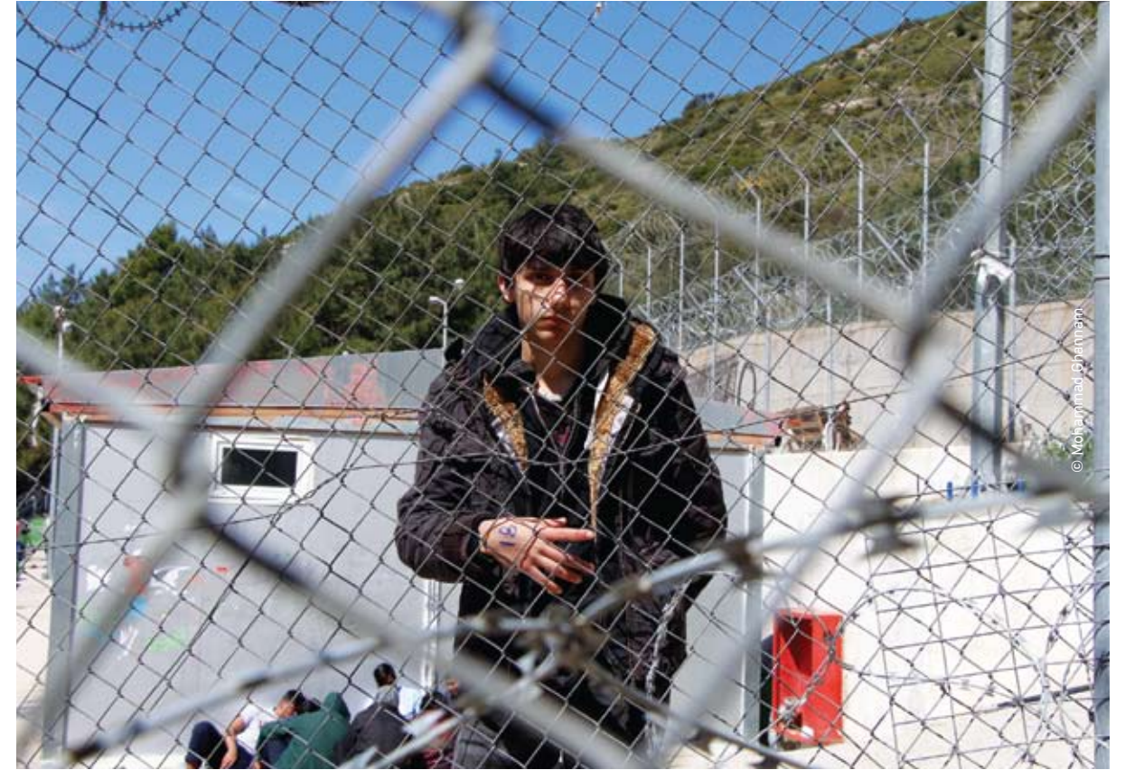
Samos / March 2016

identify people that are requesting asylum, and to identify those that can be returned to Turkey. "Accommodation" within hotspots continues to be the primary solution for people who arrive from Turkey. As a result, they are overcrowded and the alternatives are falling short to meet the needs of the new arrivals. As of 18 October, there were about 15,000 people on the islands while the capacity to house people is 7,450.