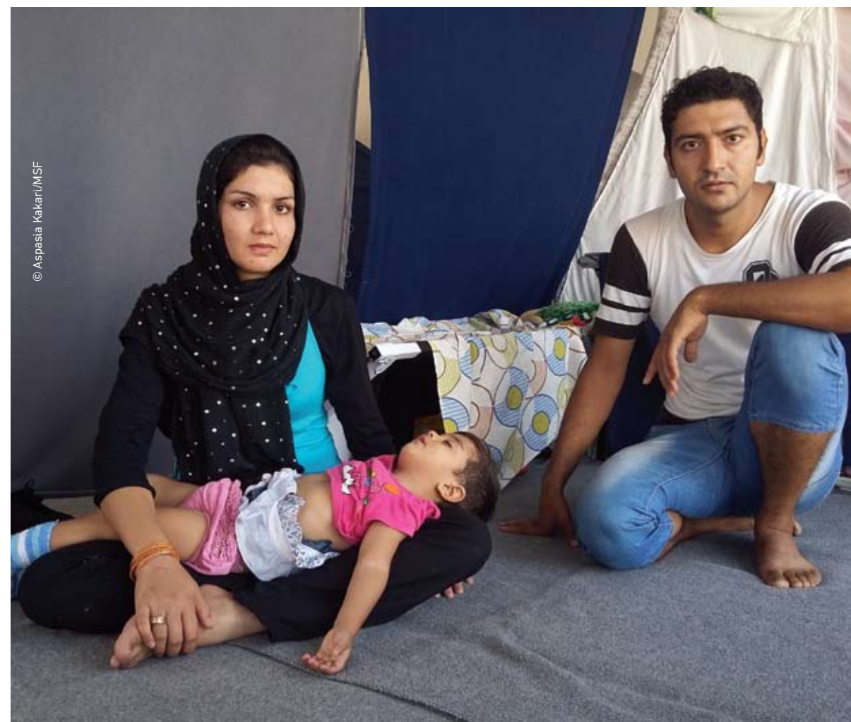
Elliniko / September 2016

Several hospitals reported to MSF their distress regarding their inability to handle the situation. Their staff are overloaded and as result very stressed; scared to make medical mistakes. There is a real willingness of the hospital staff to do their best but at the same time, there is a certain distress due to the lack of resources to cope with the situation.