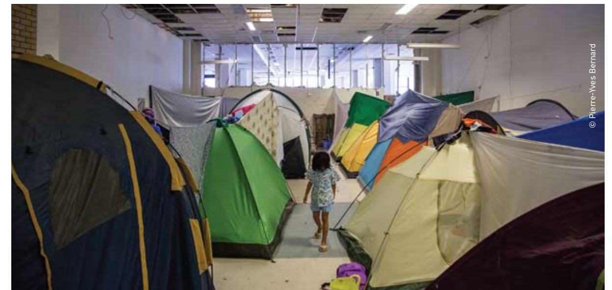
Elliniko / June 2016

On the mainland, the Greek Asylum Service (GAS), UNHCR and EASO started a pre-registration exercise on June 8th in order to overcome a backlog of pending registrations, and to identify the profiles of the people present in Greece. As of July 30th, out of 27,592 persons, 3,481 persons were identified as vulnerable as per Greek law 3 , that is 12,6% of those who were pre-registered at that time. MSF has repeatedly raised concerns that people with less visible vulnerabilities remained unidentified during the exercise. Though a 5 day training course was conducted for those participating in the pre-registration exercise; it remains difficult for un-specialised people in the course of short interviews conducted in non-private spaces to identify vulnerabilities such as victims of sexual violence, trafficking, torture or those with mental health disorders.