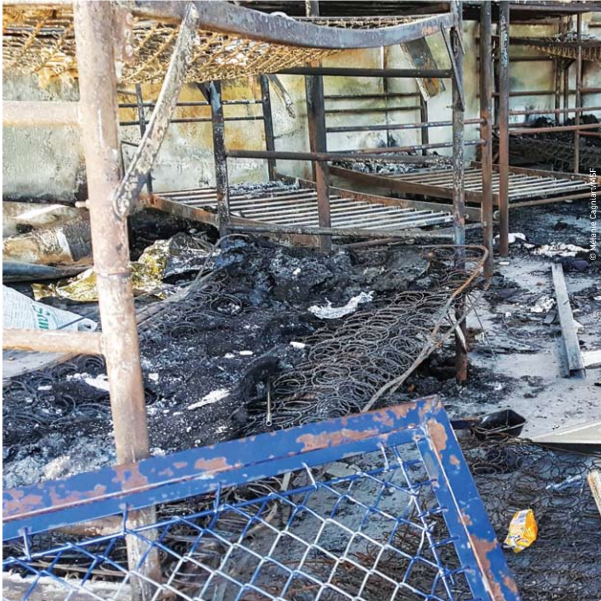
Samos / August 2016