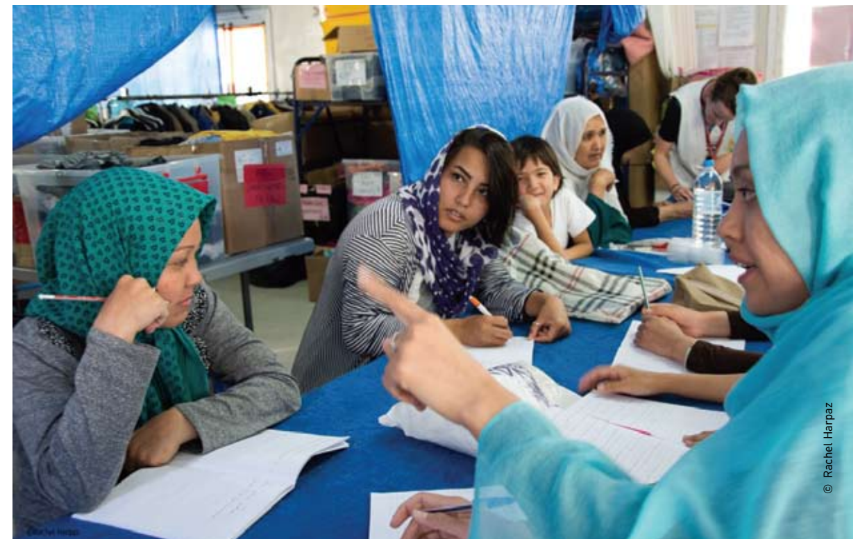
Samos / September 2016

cal interventions her role as a mother was reinforced and she rediscovered all the coping skills and strategies that were already available to her but she was not aware of. The stress gradually subsided and she is now more calm and confident, the suicidal ideation is not present anymore and she is more optimistic concerning her future and that of her family.