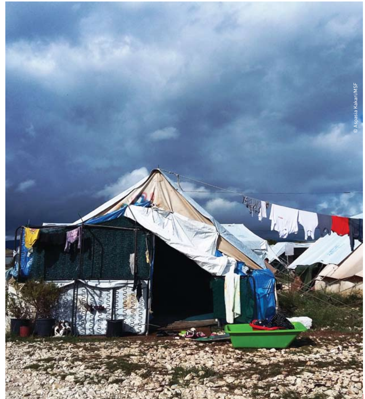
Katsikas, Epirus / September 2016