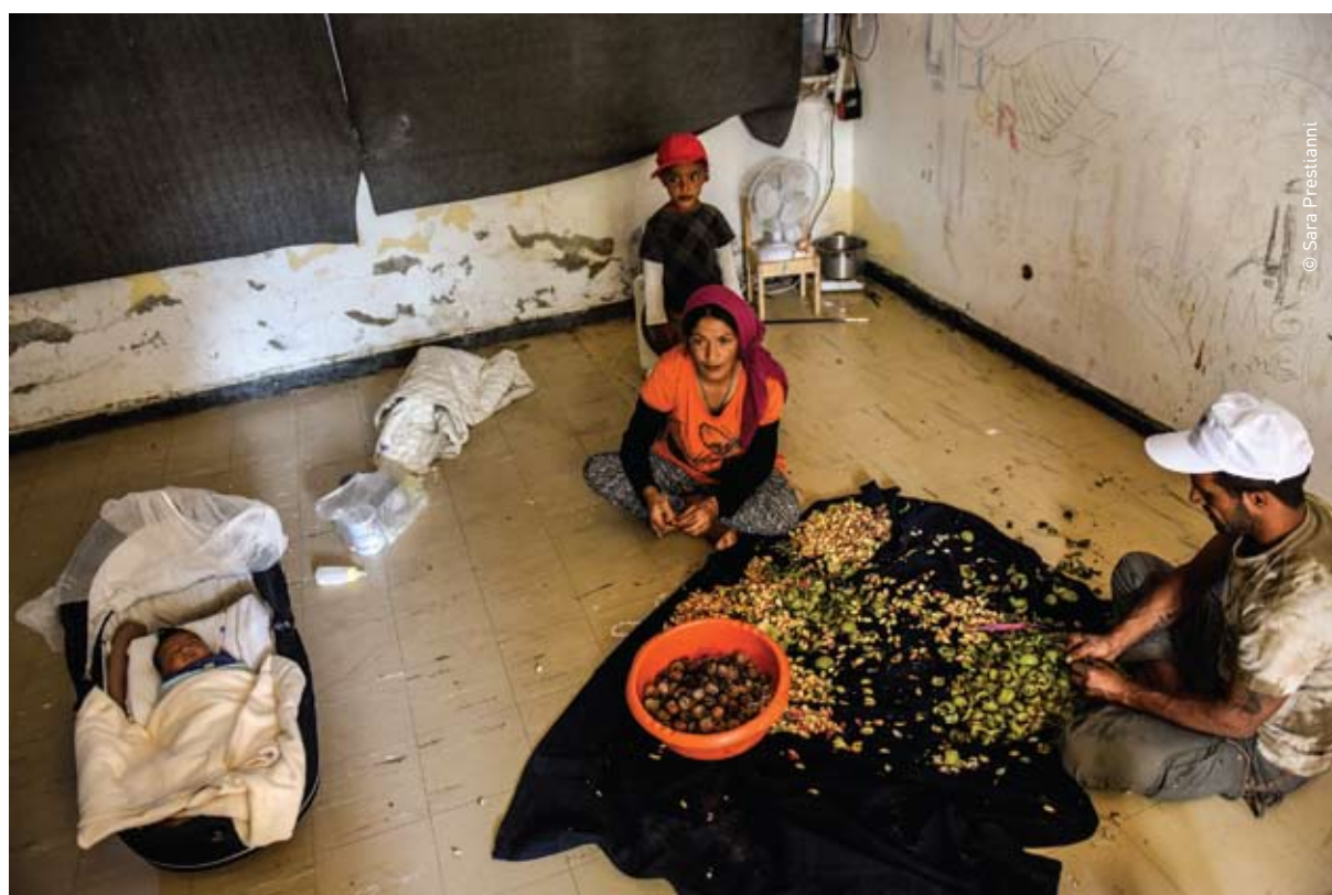
Ritsona / August 2016

Moreover, the health facilities run by the Ministry of Health don't have any cultural mediators . It makes it impossible for the medical staff to guarantee proper medical care to the patient. The patient should be able to understand the kind of pathology from which they suffer, be advised of the different therapeutic options and be able to give his/her consent. The inability to communicate with patients puts their health at risk. Cultural mediators are also essential to enable the adherence to a treatment and to be the bridge from one culture to another one. Trying to mitigate these problems, MSF has provided cultural mediators in 3 hospitals in Greece (around Thessaloniki and on Lesbos).