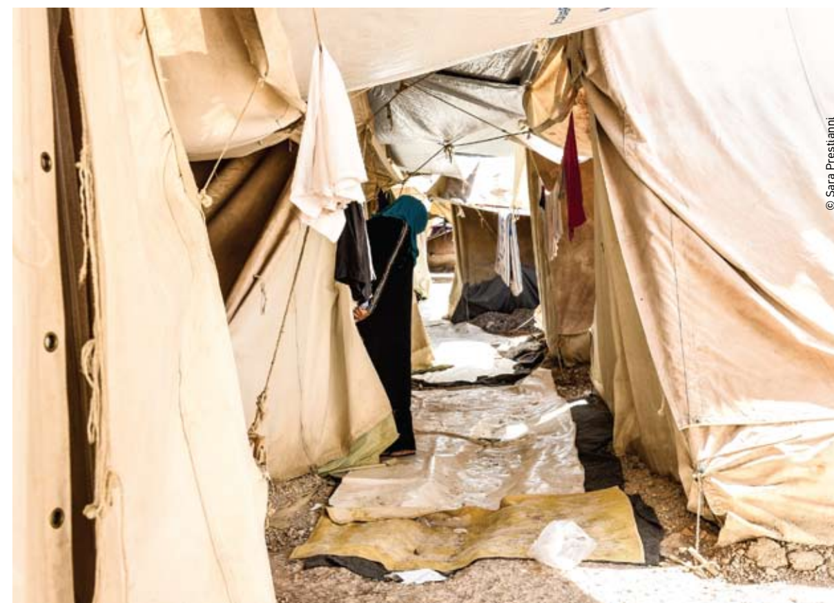
Ritsona / August 2016

People who live in tents have been exposed to heat and/or humidity during the summer (leading to soaked tents and personal belongings), insects and other animals such as snakes. Today, the winterisation of the camps has barely started and it is feared that people will not be provided with adapted shelters on time.