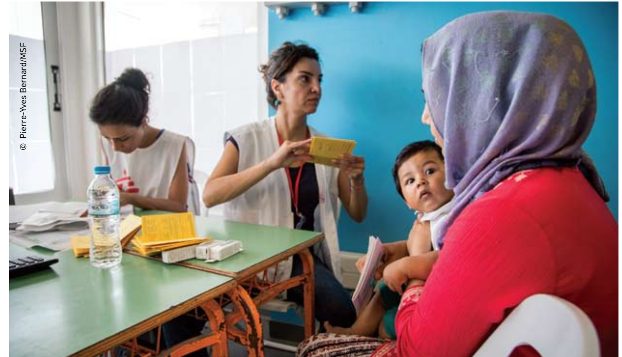
Athens / June 2016

Afghan man, 43 years old, travelling alone. He was brought to the OPD by Spanish volunteers and while waiting for the ambulance to come he had 2 epileptic seizures. In this case, the ambulance came approximately 1 h and 30 min after the call.