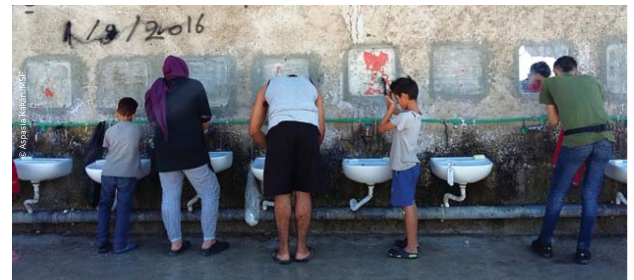
Softex, Thessaloniki / September 2016

assistance (lawyers are not always allowed to enter the hotspots although they are legally entitled to do so; appointments are announced the same day as the date of the interview which prevents the lawyers from supporting the applicants at the first stage; etc.).