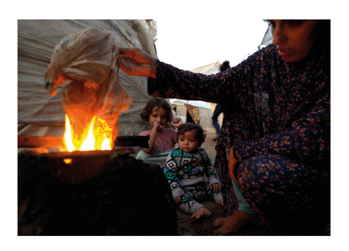
65 As Conflict Continues, Environmental Impacts of War in Gaza Become Clearer | University Stanford, California – April 2024 – <u>Available here</u>

"My son has a weak immune system. Even the smallest cut affects him. The conditions we're living in—the cold, the polluted environment—are making his condition worse. We're not in our homes, we're in tents that are unfit for human life. With everything they're dropping on us, it feels like we're breathing in sulphur. It worsens his condition, causing severe inflammations.